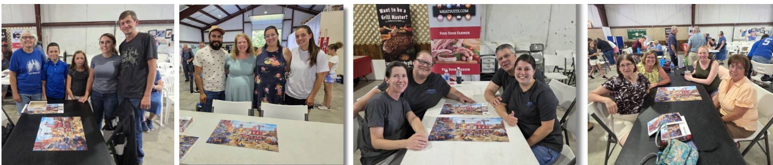
Some of our Puzzle Contest participants & winners