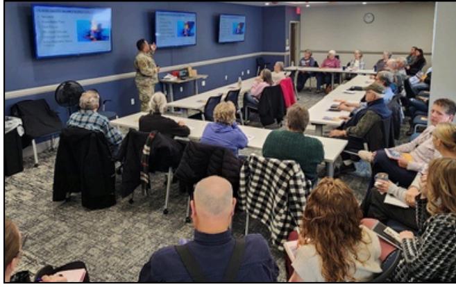
Lewis County OFA welcomes Citizen Preparedness Corps to present Emergency Preparedness for citizens of Lewis County