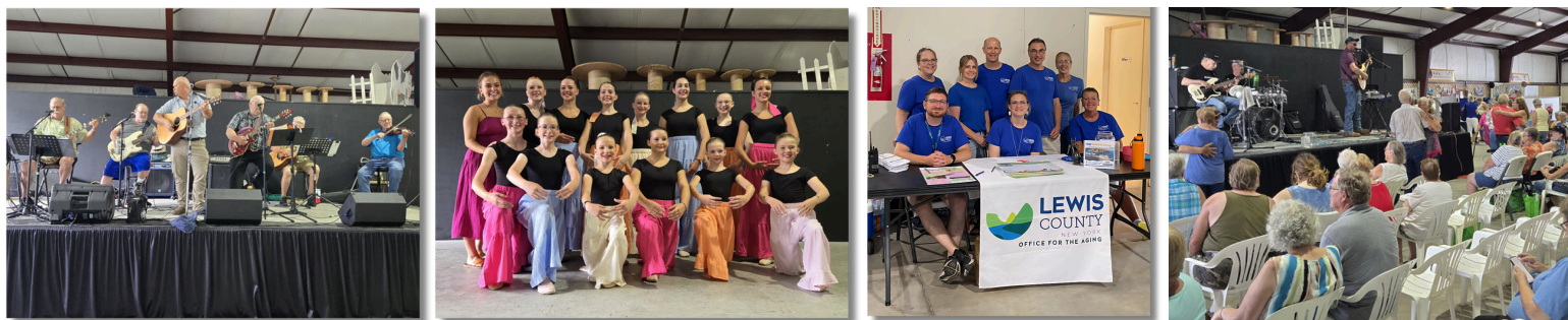
Festivities at Healthy Aging Day at the Fair

Community Engagement & Socialization - Each year our office offers free events in the community for anyone age 60 and over. These events can help promote better mental health by strengthening community connections and may reduce social isolation. Events held in 2025 included Healthy Aging Day at the Fair, the Puzzle Contest, Annual Seniors Golf Tournament, Fall Fest & Public Hearing, and our Popcorn & Movie Event. These events are advertised through outlets such as our email listing, quarterly newsletter, County Facebook page, OFA website, The Moose/WLLG Radio, and Journal and Republican.