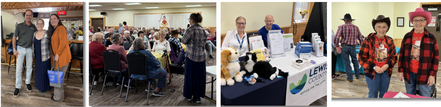
Festivities at our Fall Fest & Public Hearing