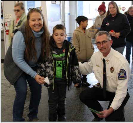
Lewis County OFA and Lewis County Emergency Management team up to "Shop with a Cop"