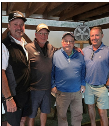
Men's A Flight - 1st