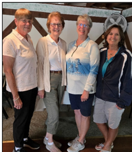
Ladies A Flight - 1st