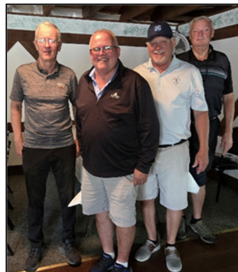
Men's B Flight - 1st