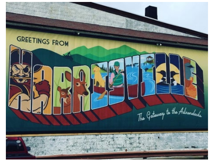
Mural at Harrisville Free Library