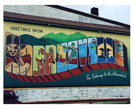
Mural at Harrisville Free Library