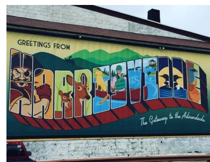
Mural at Harrisville Free Library

Description: Murals are a great way to beautify blank spaces and showcase a community's identity and history. Interested towns and villages can reach out to the Lewis County Chamber of Commerce for more information or visit https://adirondackstughill.com