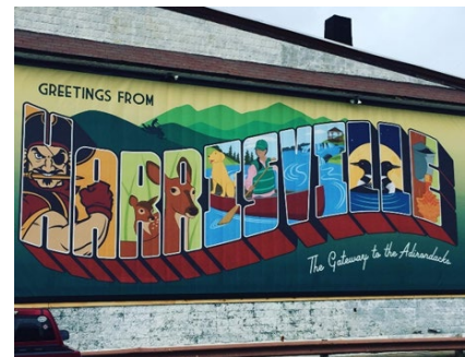
Mural at Harrisville Free Library