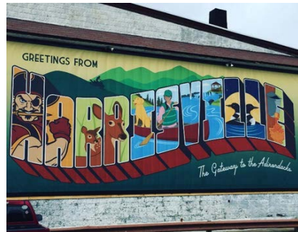
Mural at Harrisville Free Library