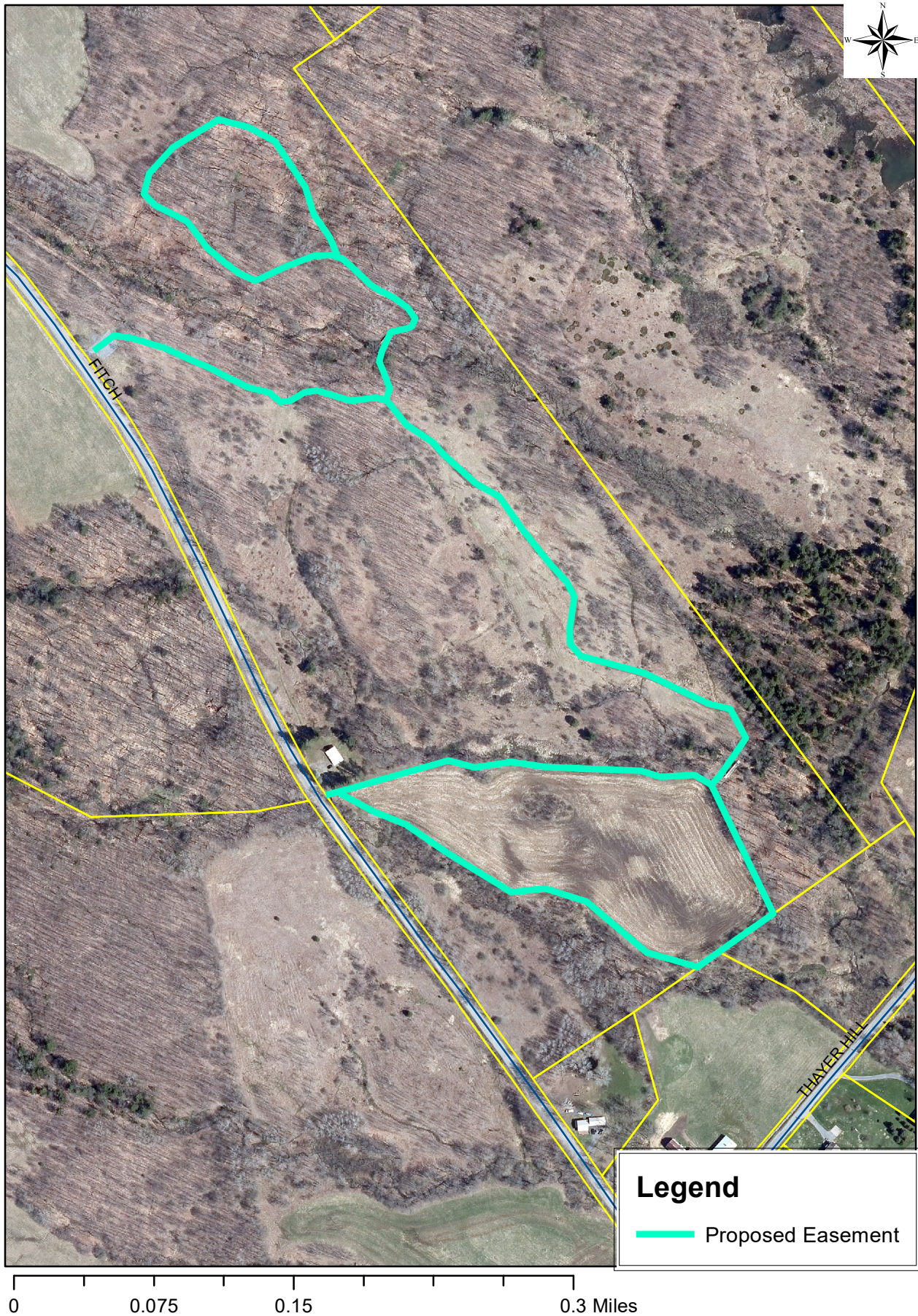
Exhibit A - Tax Parcel 402.00-01-9.113